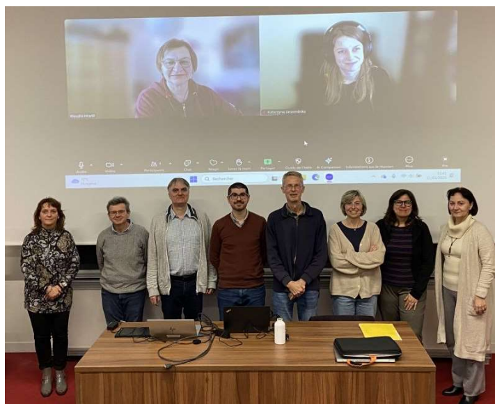
ECA Executive Committee, Montpellier, March 2025