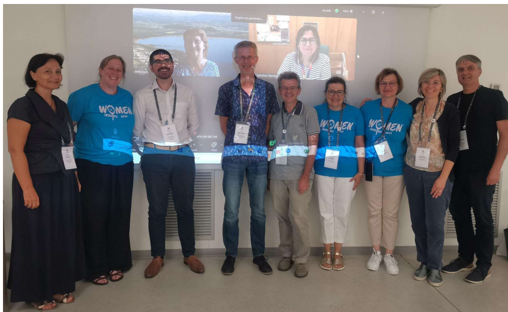
Executive Committee members, outgoing and newly elected, Padova, August 2024

In 2024 the election term of the Executive Committee ended, and a new Committee was elected by the ECA Council in Padova. The achievements of the outgoing Executive Committee were appreciated by the Council and some Committee members have been re-elected to their new roles.